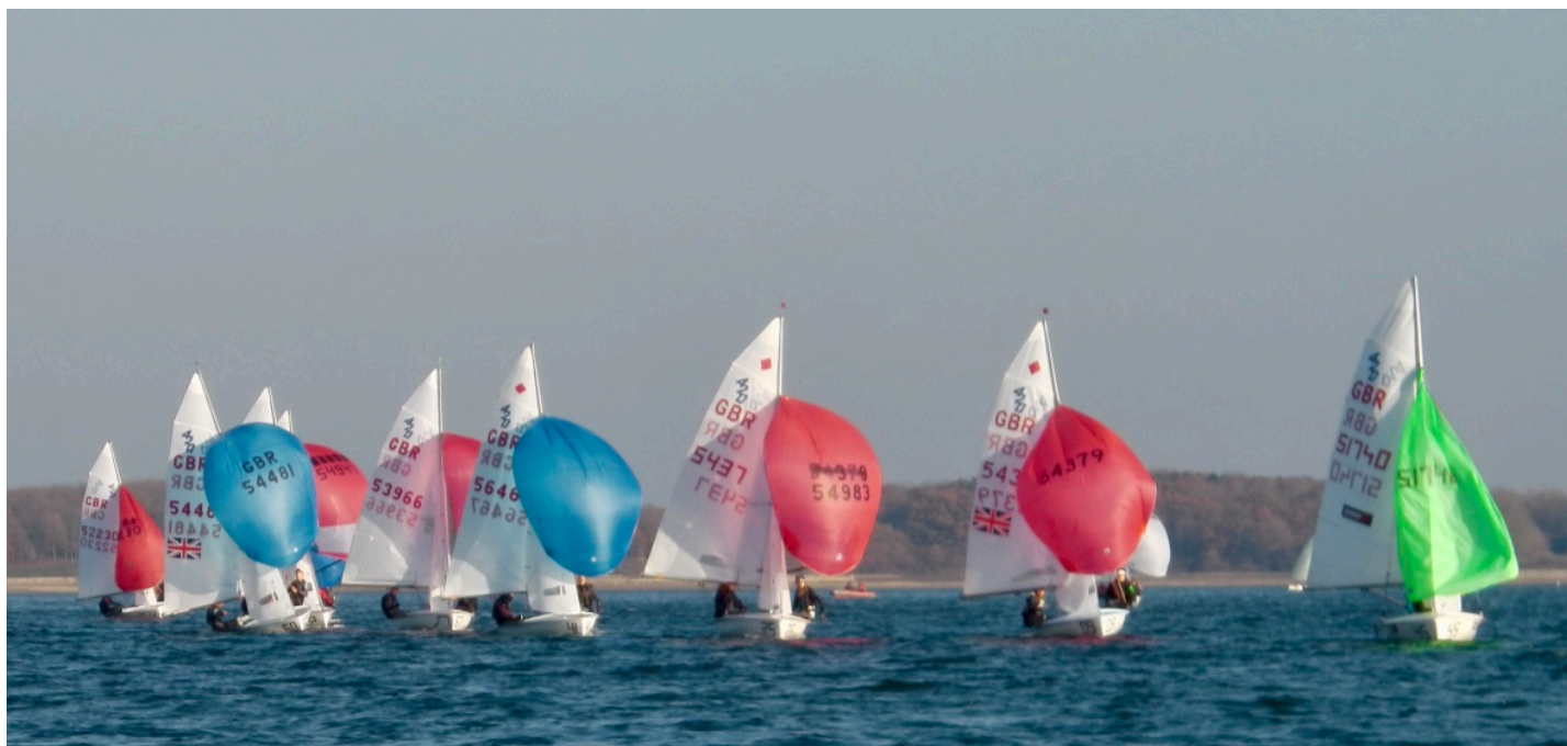
The fleet in action - End of Seasons 2018